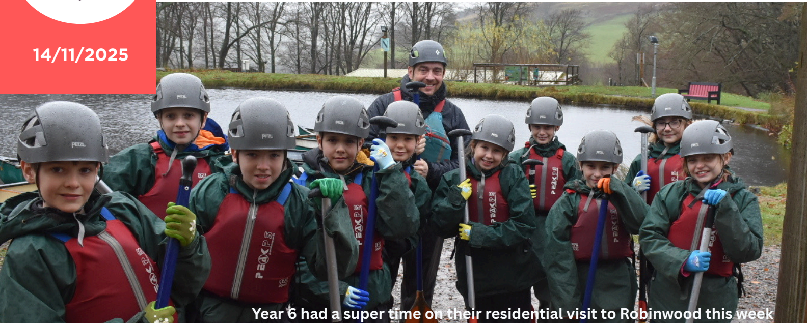
Year 6 had a super time on their residential visit to Robinwood this week