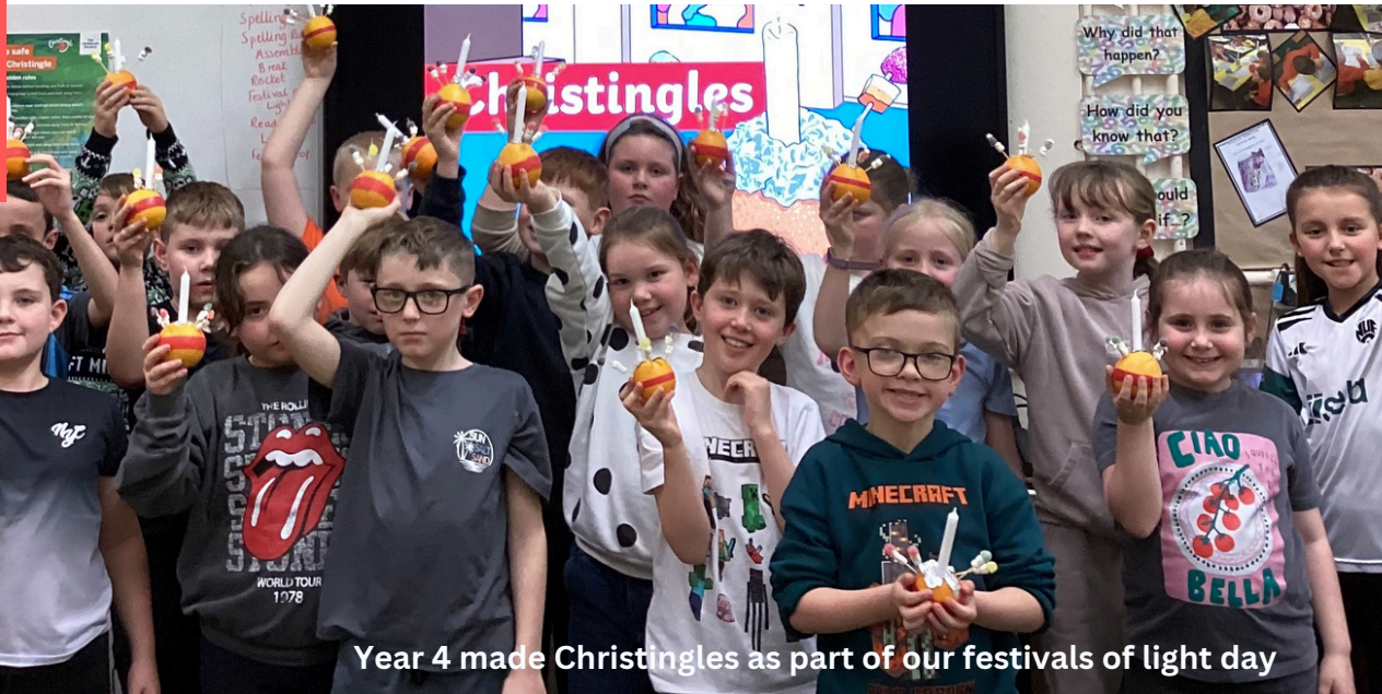
Year 4 made Christingles as part of our festivals of light day