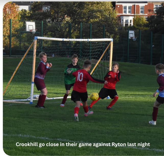
Crookhill go close in their game against Ryton last night