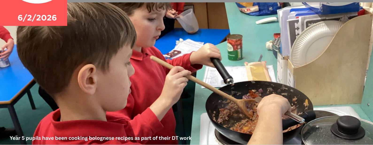
Year 5 pupils have been cooking bolognese recipes as part of their DT work