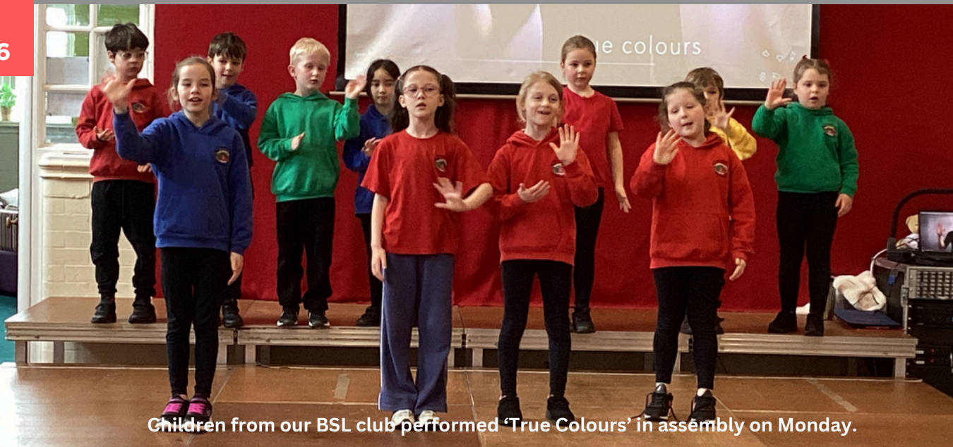
Children from our BSL club performed 'True Colours' in assembly on Monday.